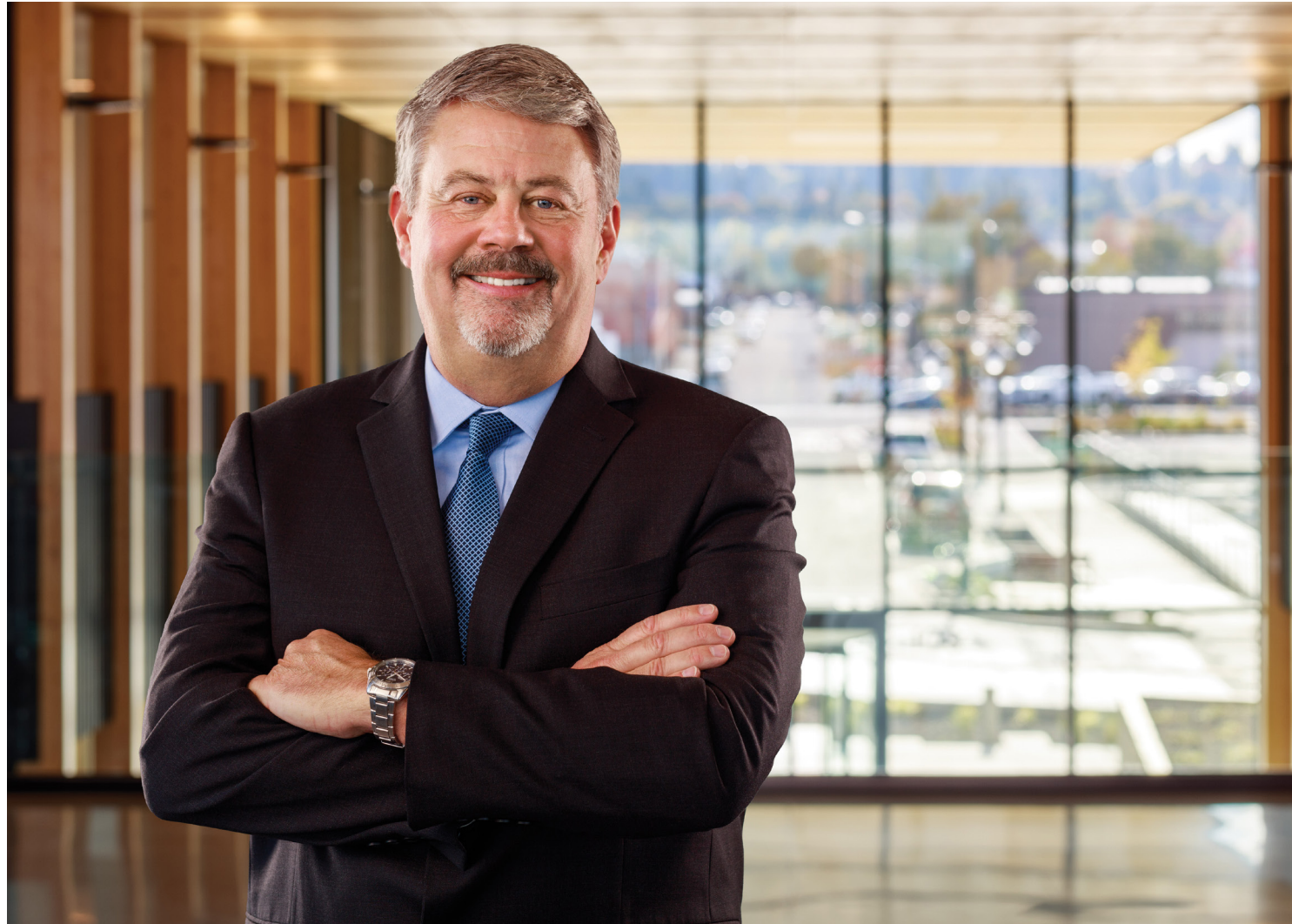
CHIEF EXECUTIVE OFFICER AVISTA CORPORATION

At Avista, we put those we serve at the center of everything we do. For over 134 years, we've been committed to delivering energy safely, responsibly and affordably.