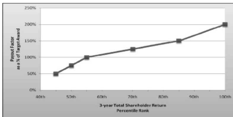
Relationship Between Avista's Relative Three-Year Shareholder Return and the Award Opportunity

The following graph represents the relationship between the Company's relative three-year total shareholder return and the award opportunity: